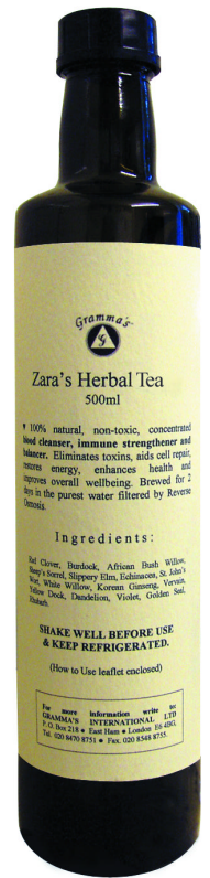
● under fire 'Zara's Herbal Tea' and other herbal foods / supplements.